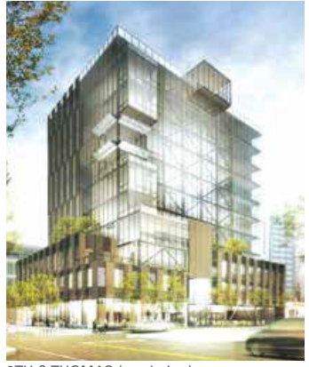
9TH & THOMAS (rendering)

privately owned and managed union-signatory, construction company. Sellen will develop the project that is designed to include flexible floor plates, outdoor decks and gardens, highend amenities and a first floor configured as a community "living room" surrounded by retail. The project will seek LEED® Gold certification. This investment is consistent with MEPT's plan to invest in urban office projects and will complement the Fund's other nearby investment in South Lake Union.