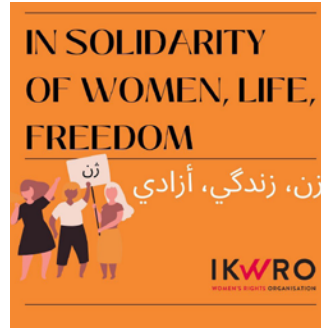
Women’s Network – Iranian & Kurdish Women’s Rights Organisation