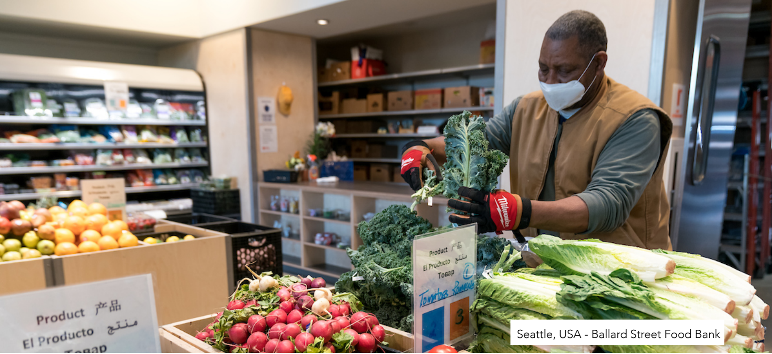
Seattle, USA - Ballard Street Food Bank