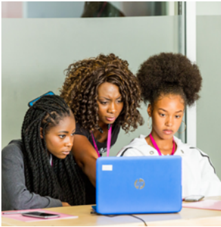
Black Professionals Alliance – Black Girls Code

Our diversity, equity and inclusion mission is extending to community groups that have been historically underserved and underrepresented, and BGO Inspired is creating new channels for support and mentorship. Our bridge-building continued in 2022, and here are a few examples of where our impact was felt: