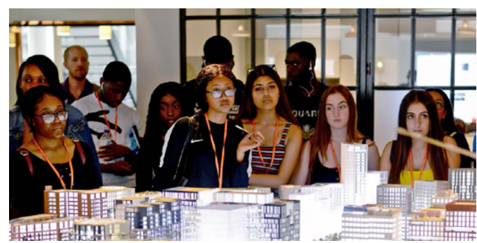
EU - Pathways to Property