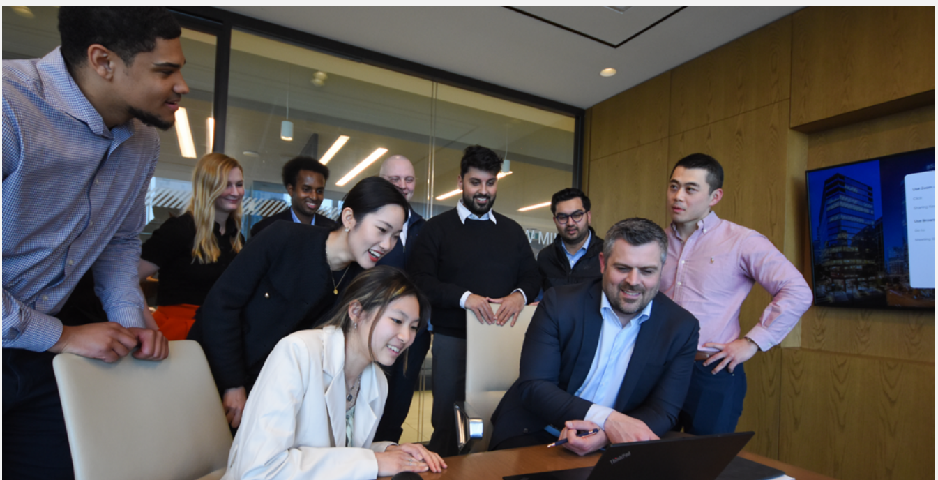
Project Destined for 2023

mentoring that delivers meaningful opportunities for diverse student populations to successfully gain a foothold in the real estate industry. These paid internships, funded by partners like BGO, are opening new doors and giving hard-working, emerging talent an early glimpse into a world of possibilities.