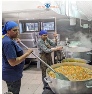
Asian Network – Guru Nanak’s Free Kitchen