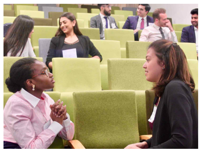
EU - UpReach

These grassroots initiatives have become a defining element in the distinct workplace cultures that we have cultivated in each of our cities, where the joys of team-building and working for a good cause become one and the same. Here is a look at the progress and care that we helped to deliver for our neighbors in their time of need: