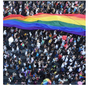
PRIDE - Outright International