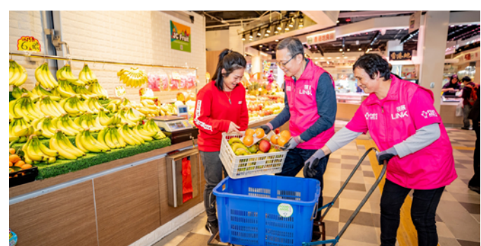
Asia -Food Angel