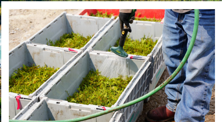
One Tree Planted