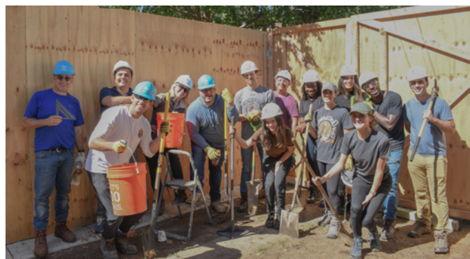
H4H - NYC

One Tree Planted continues to power our mission to plant trees around the world with particular attention to regions where natural disaster or overburdened ecologies are in dire need of help. As of 2022, we have planted over 60,000 trees in 3 continents, and these commitments are securing floodplains for the future and providing valuable training and employment for local populations.