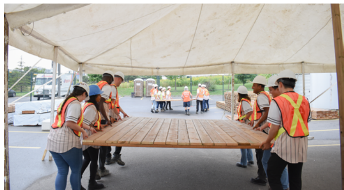
H4H - GTA