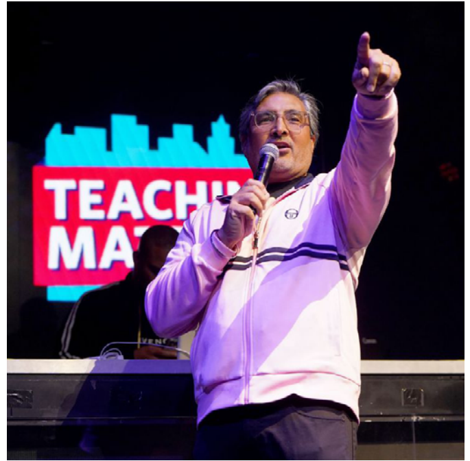
USA - Teaching Matters